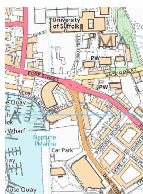
Figure 1: University of Suffolk location context